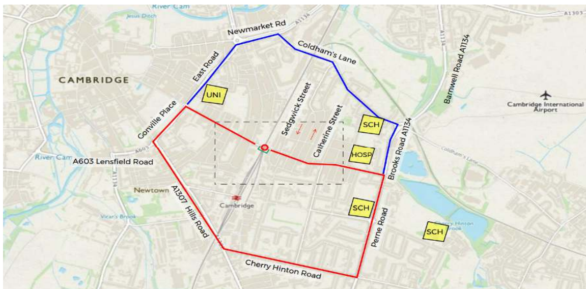
Diversion Routes shown in red and blue above.

Whilst we will endeavour to work within our usual times of 0700 to 1800 there may be times when work will continue beyond these hours to complete activities that will ensure that we meet our planned programme. These instances will be kept to a minimum and will be posted on the information boards.